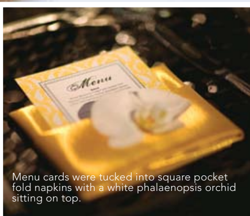
Menu cards were tucked into square pocket fold napkins with a white phalaenopsis orchid sitting on top.