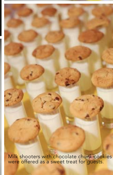
Milk shooters with chocolate chunk cookies were offered as a sweet treat for guests.