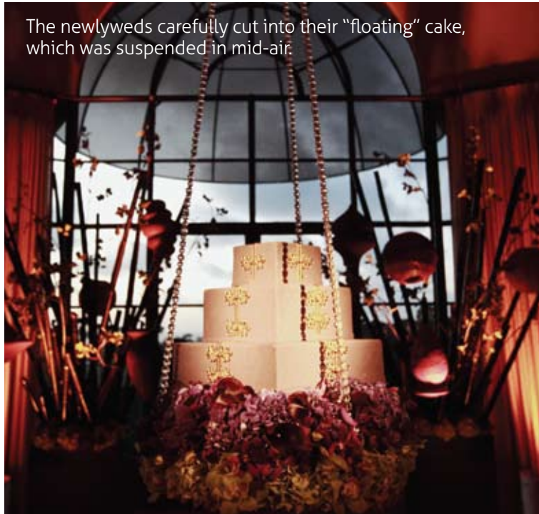
The newlyweds carefully cut into their "floating" cake, which was suspended in mid-air.