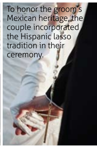
To honor the groom's Mexican heritage, the couple incorporated the Hispanic lasso tradition in their ceremony.