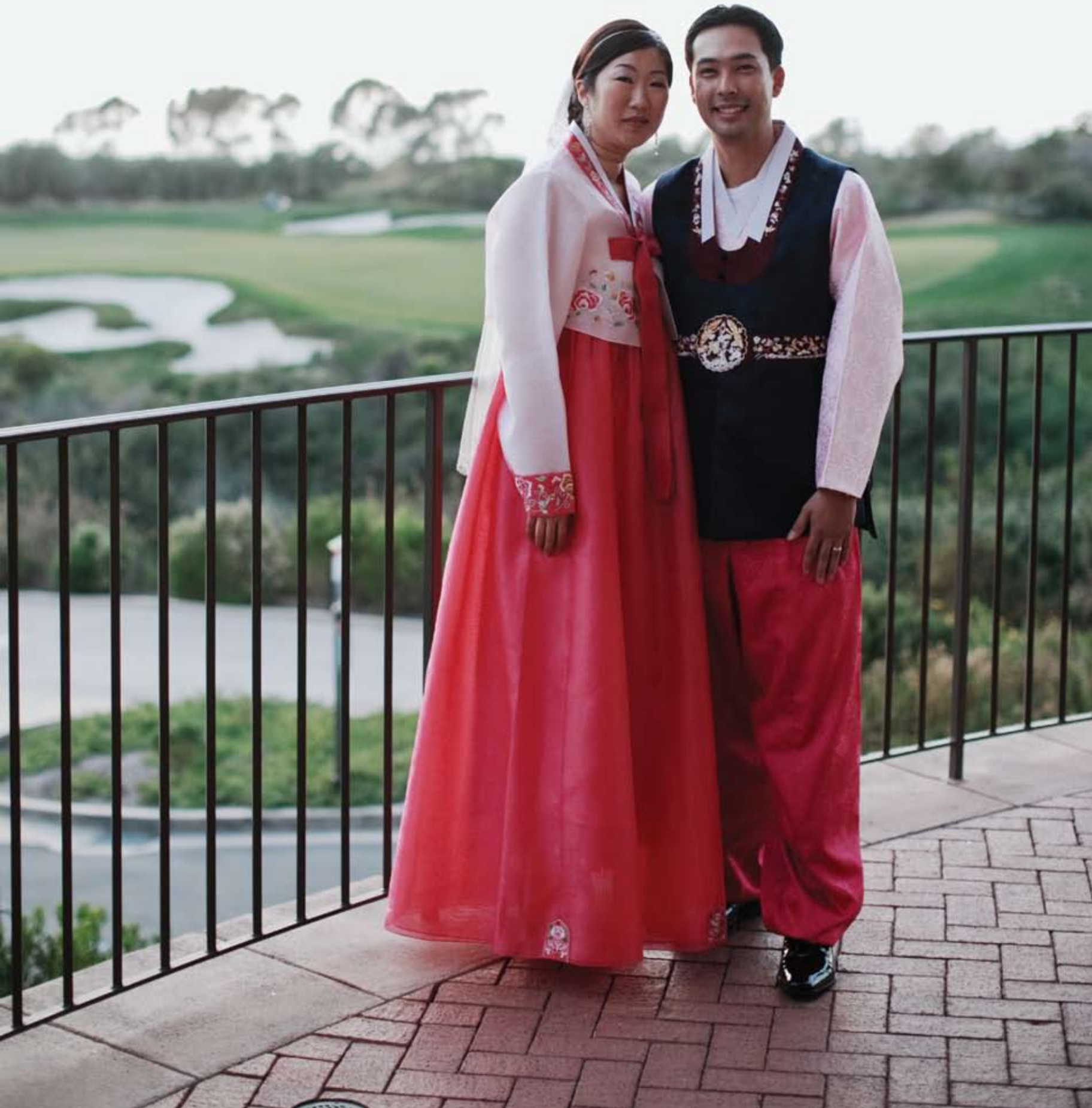
The bride and groom smiling in their hanbok , traditional Korean garments.